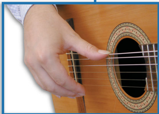
Le pouce joue la corde de mi