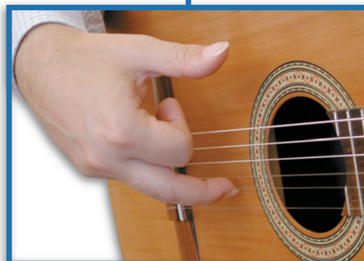
Le majeur joue la corde de si