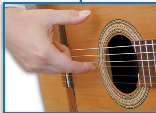
L'index joue la corde de sol